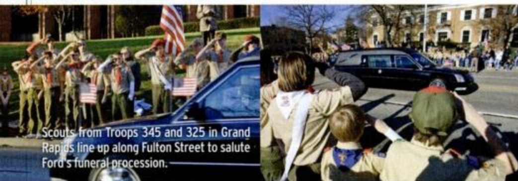
Scouts from Troops 345 and 325 in Grand Rapids line up along Fulton Street to salute Ford's funeral procession.