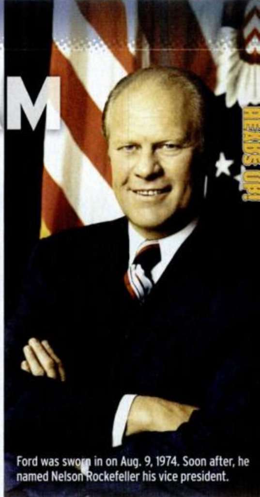
Ford was sworn in on Aug. 9, 1974. Soon after, he named Nelson Rockefeller his vice president.

After Gerald Ford died late last year, hundreds of Boy Scouts came to Grand Rapids, Mich., Ford's childhood home, for one final salute. Ford, the only Eagle Scout to become president, was the 38th president, serving from 1974 to 1977. He assumed the presidency after Richard Nixon resigned in the wake of the Watergate scandal.